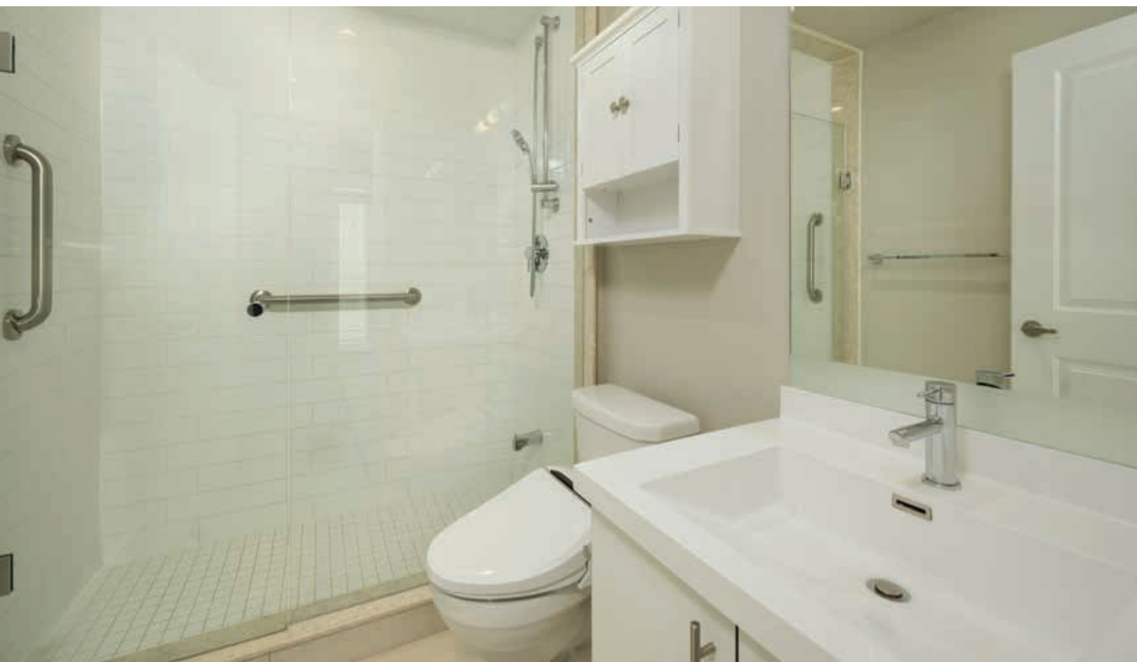
PRIMARY BEDROOM & ENSUITE