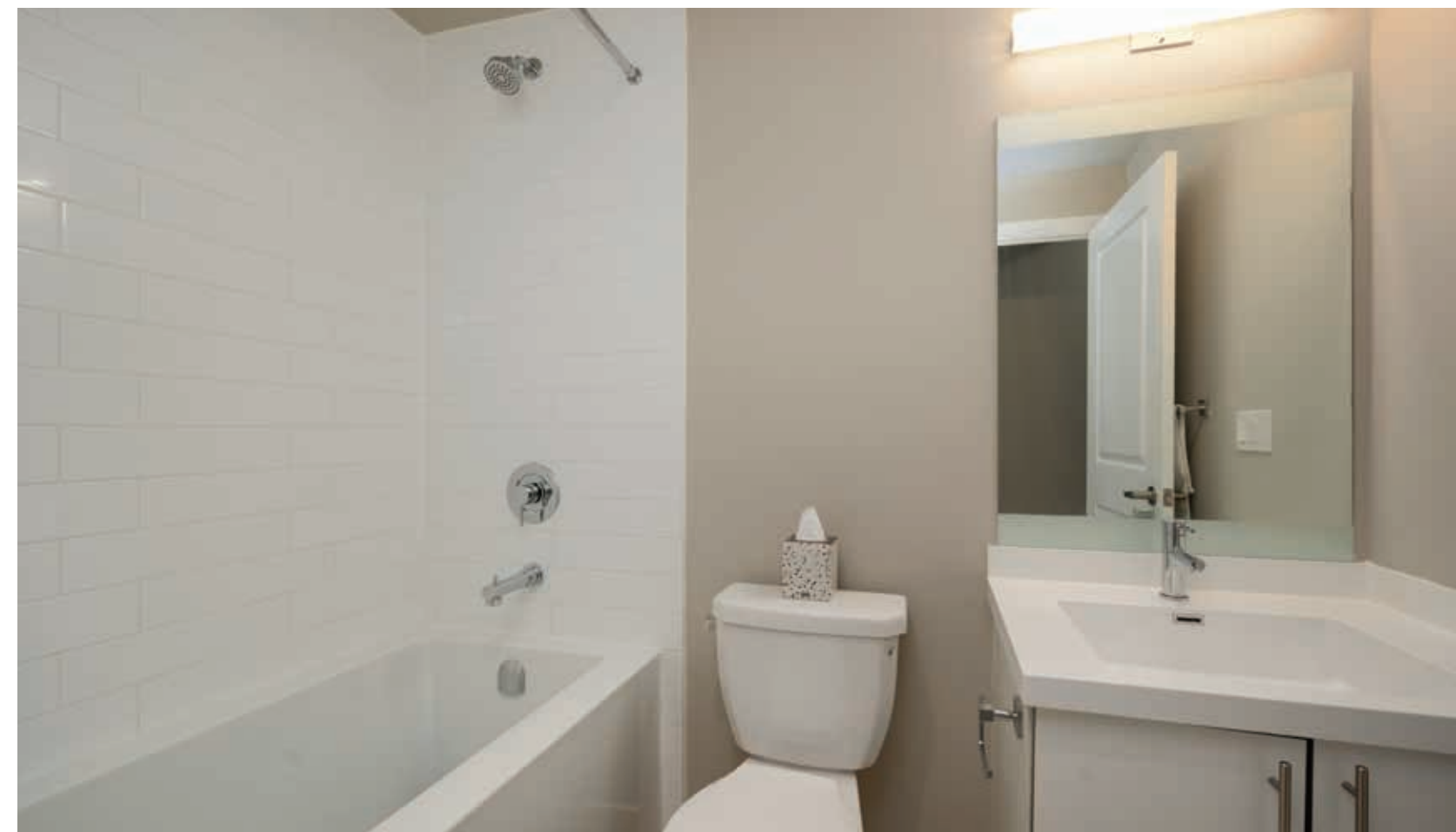
SECOND BEDROOM & MAIN BATHROOM