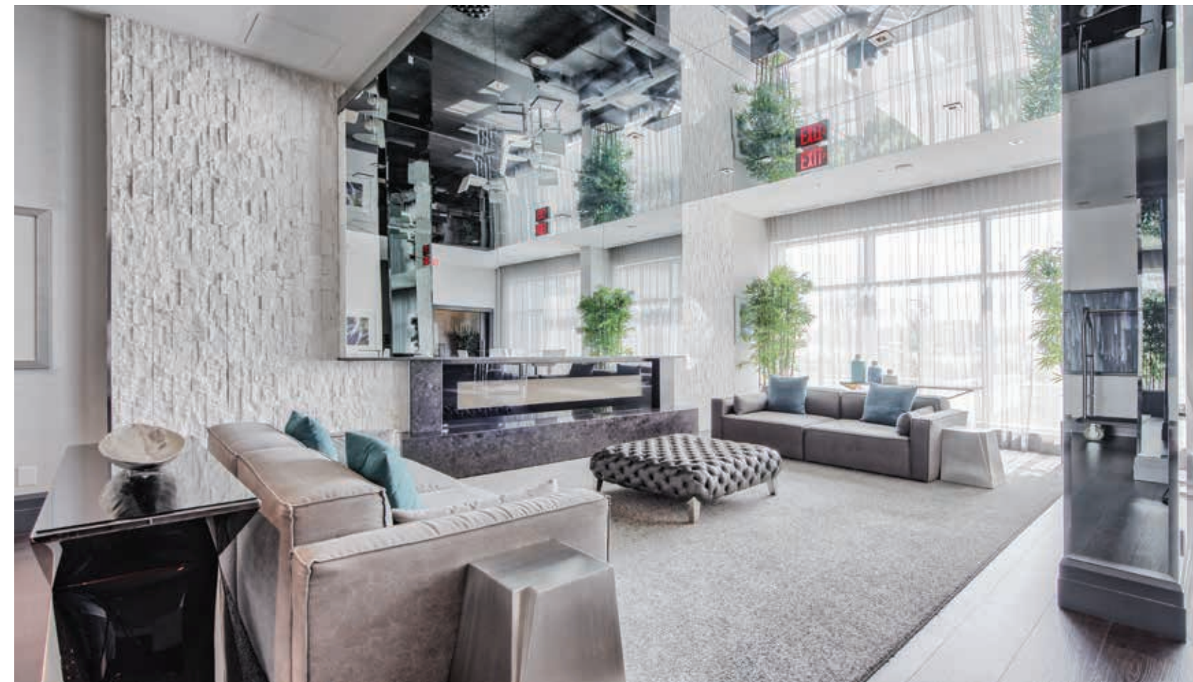
AMENITIES - PARTY ROOM