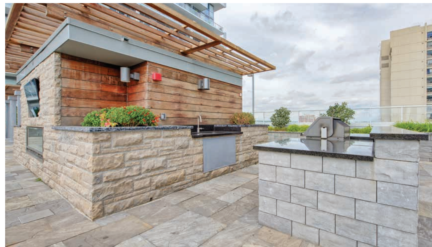
AMENITIES - TERRACE